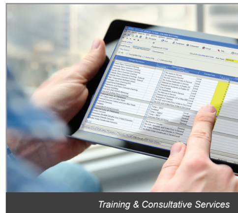
Training & Consultative Services